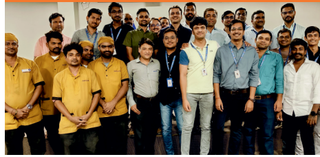
International Men's Day celebration at Aadicura