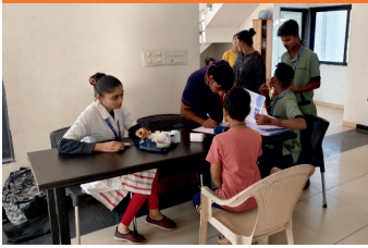
Society health checkup camp at Viram 2 Vadsar