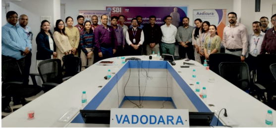
Health talk organized at SBI bank