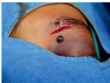
- PELLET REMOVAL

local hospital, where he was referred to a higher centre. On further investigation in the form of an X-ray and CT scan, the local doctor could locate the pellet in his left eye. Due to the complexities and the lack of medical expertise or experience, the