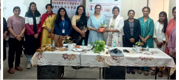
Health Talk at FCI