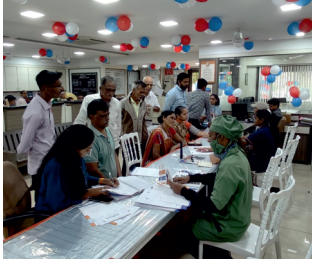
Kalupur Bank health checkup camp for employee