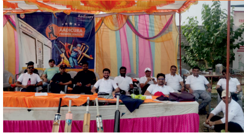
Cricket tournament organized for doctors of Godhra