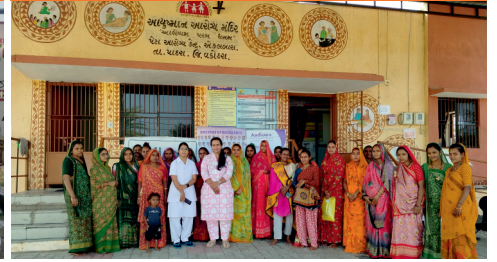
Health talk organized at Ekalbara