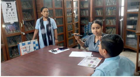
Eye checkup camp organized for children of Rosary school